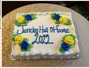
Left and above: The obligatory crowd shot and cake shot. If it had been cheesecake, this would be a cheesecake pic. But, alas, it was not cheesecake. Maybe next year.