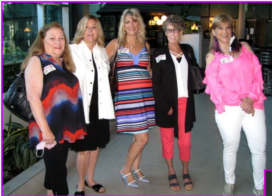
A couple of group shots.